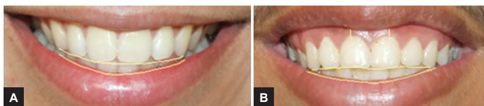
Figs 3A and B: (A) Subject showing parallel smile arc; and (B) Subject showing straight smile arc