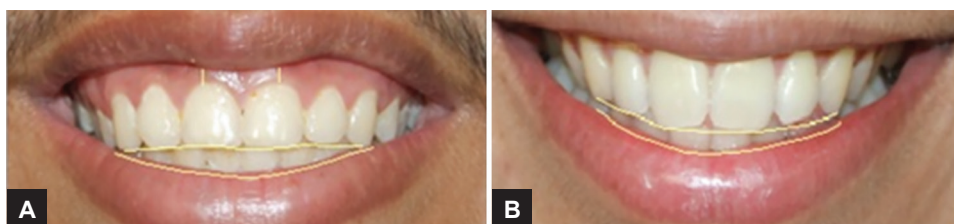
Figs 4A and B: (A) Subject showing gingival display; and (B) Subject showing no gingival display