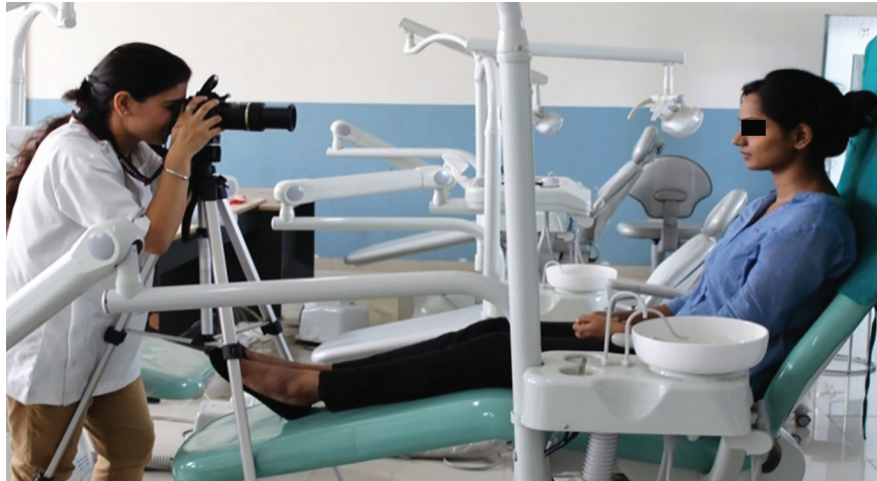
Fig. 1: Standardized procedure to obtain lateral view of the full face

crown, partial veneer crown, and crown buildup on the anterior maxillary natural teeth; subjects with absence of orthodontic appliance in the superior anterior teeth and absence of any previous orthodontic treatment; subjects with anterior teeth fractures; subjects with incisal wear of maxillary anterior teeth; and subjects with absence of any previous orthodontic treatment. A participant informed consent form was provided in both Hindi and English languages. A standardized photographic procedure was used to obtain images of the face and maxillary central incisors and was as follows: Each subject was made to sit upright on a chair with the occlusal plane of the maxillary teeth parallel to the floor. Two standardized photographs were taken for each subject: Portrait (social smile) and smile photograph (social smile). 4 For each photograph, standardized distances (portrait: 100 cm, smile photograph 12 cm) were used (from the tip of the subjects' nose to the center of the camera lens). A fixed focus of 1:1 was used for each subject, with the electric field 100 mm f/2.8 macroultrasonic focus motor lens. The height of the Canon electric optical system (EOS) 1100D Digital Single Lens Reflex camera mounted on a tripod (Traveler Mini Pro Tripod For Canon EOS 1100D) was adjusted individually according to the position of the subjects' face and the teeth. The images were then transferred in Digimizer ® Image Analyzer software version 4.6.0 (Fig. 1).