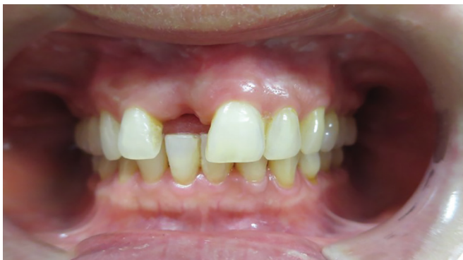
Fig. 1: Visual inspection method wherein the operator visually evaluates the gingival biotype for the anterior maxillary zone extending from canine to canine