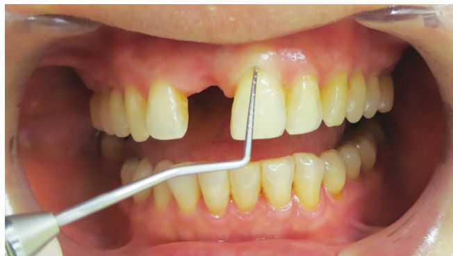
Fig. 2: Probe transparency method wherein the operator insert the periodontal probe into gingival sulcus of maxillary anterior teeth from canine to canine to check probe visibility and, thus, evaluate gingival biotype

placement at the Department of Oral Implantology, Faculty of Dentistry, Melaka-Manipal Medical College, Malaysia. The study was conducted in accordance with and approval from the Research and Ethics Committee, Faculty of Dentistry, Melaka-Manipal Medical College, Malaysia. Written informed consent was obtained from all volunteering patients. Patients eligible for this study according to the inclusion criteria included those with clinically healthy gingiva, indicated for dental implant placement in the maxillary anterior region, and presence of a minimum of one central incisor. Exclusion criteria for the study were clinical evidence of gingival or periodontal diseases, pregnant and lactating women, and patients under medications, which can induce gingival enlargement. No external funding was received for this study.