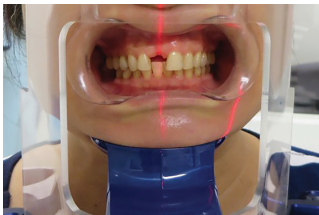
Fig. 3: Soft tissue cone beam computed tomography method wherein the cheek retractor is placed in inverted position to retract the lip while obtaining CBCT image of gingival tissue in maxillary anterior zone

The ST-CBCT scans were done using Planmeca 3Ds CBCT machine Romexis 3.0.1R with a standard investigation protocol of maximum 90 kVp, maximum 12 mA, and field of view (FOV) = 5 × 8 cm. Patients’ chin and heads were stabilized for the ST-CBCT scanning. The variant CBCT procedure carried out in this study was in accordance with the procedure explained by Januário et al. 9 Cheek retractor was placed in an inverted position to avoid hitting on the chin stabilizer as shown in Figure 3. This procedure was done so that the soft tissues of the lips were positioned away from the gingival tissue. The images were generated and saved in the patient’s folders until analysis. Figure 4 shows the measurements performed with the Romexis Measurement tool software (3.0.1R). Voxel size of 200 μm was used. The contrast and brightness of the image were