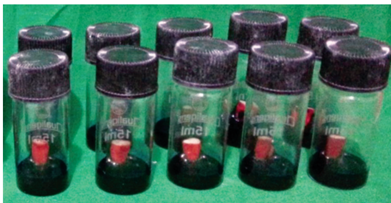
Fig. 1: Samples dipped in methylene blue dye