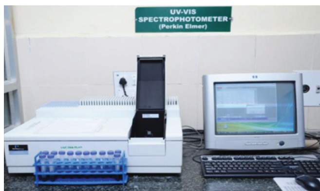
Fig. 2: Spectrophotometric analysis

tive defects. Proper cleaning of teeth was done. The teeth were decoronated at the cemento-enamel junction by using diamond disks. The canal length was determined by using a size 10 K-type file (Kendo, Germany) and the working length was established by reducing 1 mm from the obtained length. The root canals were prepared with the rotary pro-taper files till F2 (Dentsply, Mailer, Switzerland) with the crowdown technique until working length was reached. During the biomechanical preparation the canal patency was maintained with a size 10 K-file and irrigation with 5.25% sodium hypochlorite solution was carried out. After using the last file, the roots were irrigated with saline solution and dried with absorbant paper points (Dentsply, Germany). The canals were irrigated in between instrumentation with 17% ethylene diamine tetra-acetic acid (EDTA, Prime dental, India) and 5.25% sodium hypochlorite.