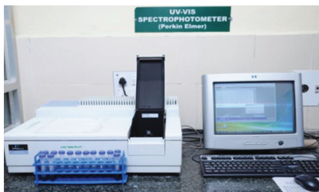
Fig. 2: Spectrophotometric analysis

tive defects. Proper cleaning of teeth was done. The teeth were decoronated at the cemento-enamel junction by using diamond disks. The canal length was determined by using a size 10 K-type file (Kendo, Germany) and the working length was established by reducing 1 mm from the obtained length. The root canals were prepared with the rotary protaper files till F2 (Dentsply, Mallifer, Switzerland) with the crowdown technique until working length was reached. During the biomechanical preparation the canal patency was maintained with a size 10 K-file and irrigation with 5.25% sodium hypochlorite solution was carried out. After using the last file, the roots were irrigated with saline solution and dried with absorbant paper points (Dentsply, Germany). The canals were irrigated in between instrumentation with 17% ethylene diamine tetra-acetic acid (EDTA, Prime dental, India) and 5.25% sodium hypochlorite.