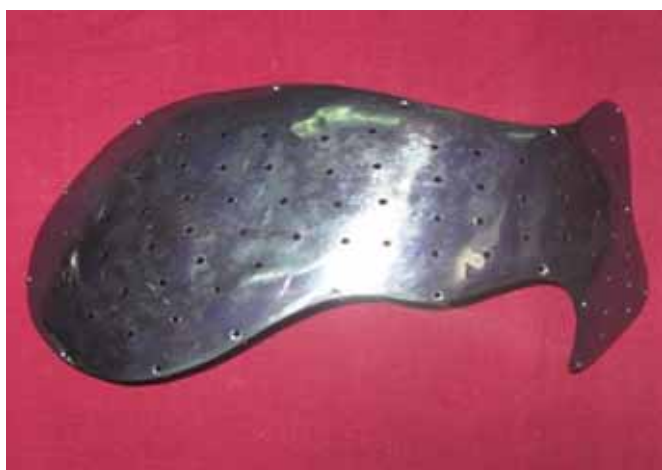
Fig. 6: Titanium cranial prosthesis