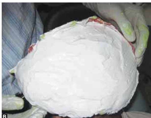
Figs 3A and B: Impression making of the defect