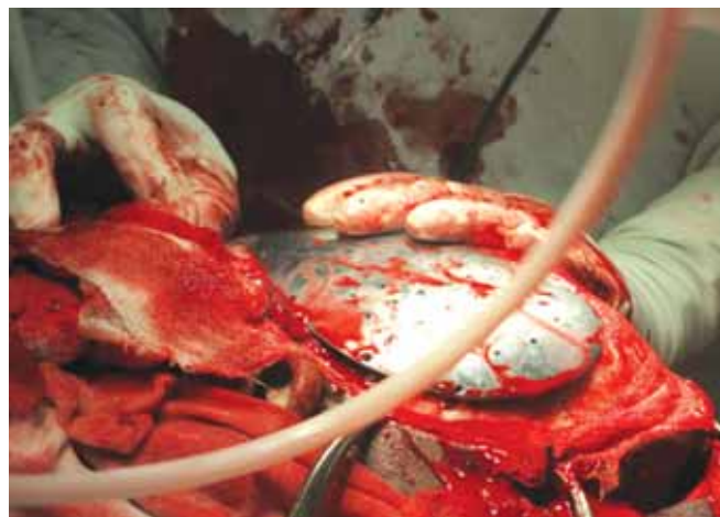
Fig. 7: Assuring the fit of the prosthesis before stabilization

pericranium in place. The incision was then retracted with opposing skin hooks and a needle tip cautery device used to cut and coagulate the deeper tissues. Dissection was then continued until the margins of entire defect were delineated in a suprapariosteal plane. The fit of the margins of the cranial prosthesis were checked and found to be accurate (Fig. 7). Corresponding to the periphery holes on the plates, certain markings were made over the intact bony margin using electrocautery. With no. 40 bone bur, holes were drilled through the outer table of skull into the diploe layer of the bone at the points previously marked under copious saline irrigation. An additional hole was then drilled into the diploe layer so as to contact each of the former holes at right angles (Fig. 8). Then 1-0 prolene suture was passed through all these two holes and their corresponding holes on the periphery of the titanium plate giving tripod stability to the plate (Fig. 9). After the initial stabilization with the help of sling sutures the plate was evaluated for bulk, contour, margin thickness, and position, and then finally sutured firmly to the desired area (Fig. 10). Copious antibiotic laden irrigation was done to ensure the wound was free of debris. Closure was then performed in layers using Vicryl to close the underlying galea and subcutaneous