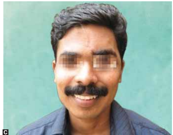
Figs 11A to C: Postoperative results after (A and B) 10 days (C) 4 months

Apart from cosmetic improvement, cranioplasty improves systemic cardiovascular and cerebral hemodynamic functions. 10 Gardner reported a syndrome characterized by headaches, dizziness, irritability, epilepsy, discomfort and psychiatric syndromes that he had observed in patients with cranial defect. He called it the “syndrome of the trephined” and was the first to describe an improvement in the neurological function of some patients who underwent cranioplasty with tantalum. 11-13 Unexpected improvements in the neurological status and in