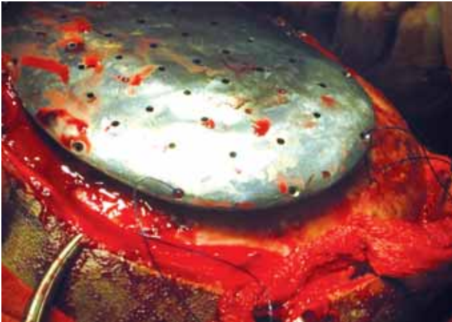
Fig. 9: Initial stabilization of the prosthesis by sling sutures