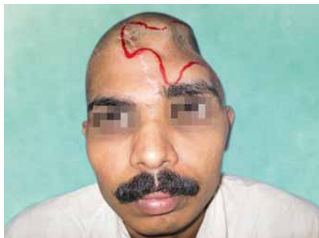
Fig. 1: Preoperative view of the patient showing the skull defect

The cleanly shaved skull defect of the patient was gently palpated to identify the periphery of the cranial defect. An indelible pen line was marked about 3 mm beyond to indicate the outermost border of the prosthetic device to be fabricated (Fig. 2). The wax was adapted to the defect margin to serve as