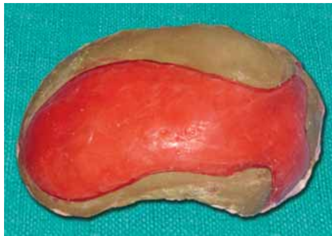
Fig. 4: Wax build-up of the defect

A wax pattern was then made to the exact dimension and contour of the skull defect image derived from the positive