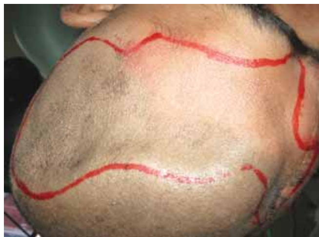
Fig. 2: Extent of the skull defect