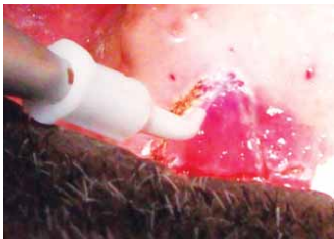
Fig. 3: Application of laser beam

The application was repeated two times per visit and entire treatment was completed within two visits. The patient was advised about the importance of oral and denture hygiene and educated regarding denture usage. One week later the complete resolution of infection was observed. With 6 months follow-up the patient was free of infection and he was comfortable in wearing denture (Fig. 4). The patient was advised to report periodically.