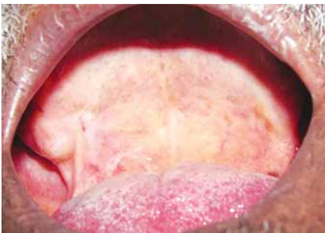
Fig. 4: Complete resolution of lesion

The application was repeated two times per visit and entire treatment was completed within two visits. The patient was advised about the importance of oral and denture hygiene and educated regarding denture usage. One week later the complete resolution of infection was observed. With 6 months follow-up the patient was free of infection and he was comfortable in wearing denture (Fig. 4). The patient was advised to report periodically.