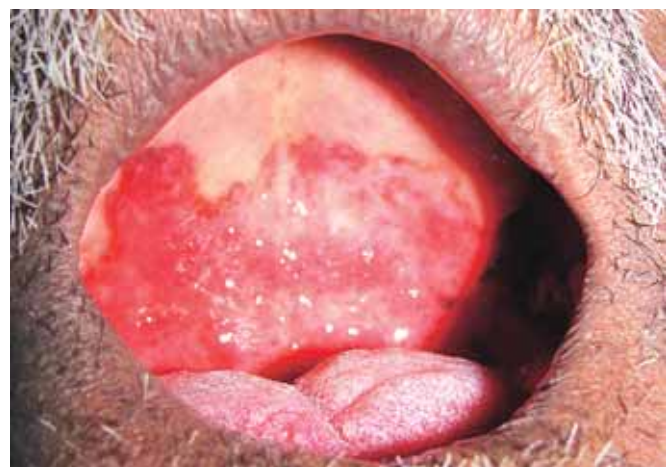
Fig. 1: Intraoral photograph showing erythematous palatal mucosa

of burning sensation in mouth for past three and half months. History reveals he was completely edentulous and wearing complete upper and lower denture for past 6 months. Medical history was not contributory. On intraoral examination, an erythematous patch was observed on posterior part of the hard and soft palate (Fig. 1). Alveolar ridge of maxilla and mandible and other mucosal areas appeared normal. Clinically, it was diagnosed as denture stomatitis involving palatal mucosa. Exfoliative cytology was performed and stained with periodic acid-Schiff (PAS) method, which showed fungal hyphae with inflammatory and squamous cells (Fig. 2). The case was diagnosed as type II denture stomatitis. The patient has been treated with 980 nm wavelength diode laser to ablate the palatal lesion in low power setting of 2 watt for 15 seconds (Fig. 3).