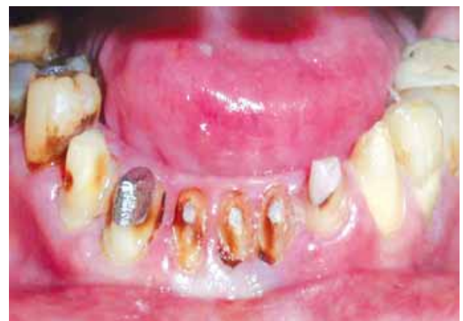
Fig. 4: Reduction of overdenture abutments