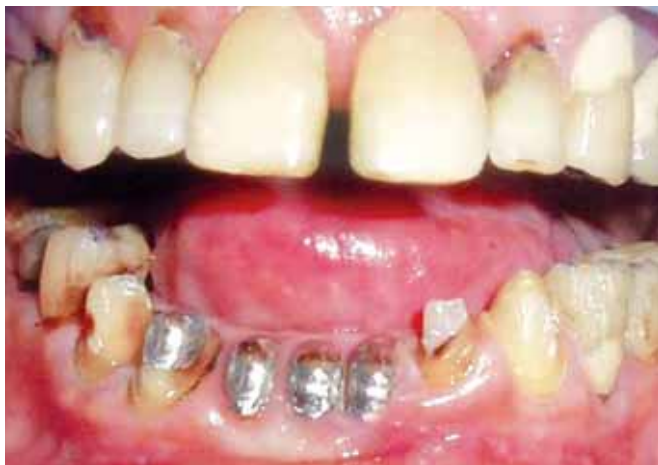
Fig. 5: Metal copings on overdenture abutments and reduction of conventional abutments