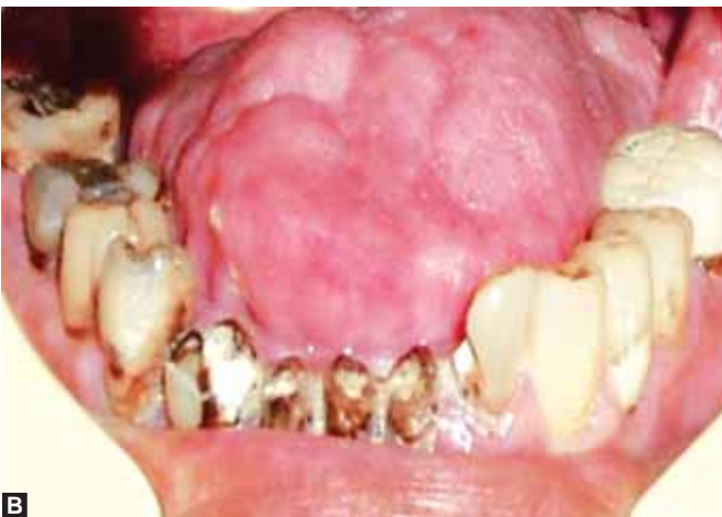
Figs 1A and B: Intraoral preoperative view of (A) maxillary arch, (B) mandibular arch