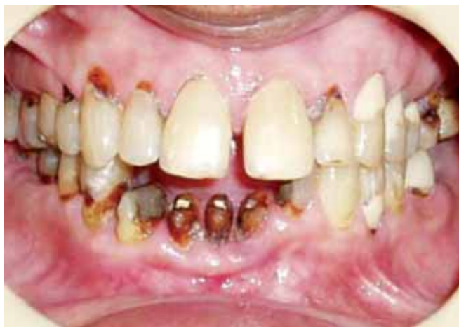
Fig. 2: Frontal preoperative view

The step by step definitive procedure was as follows: