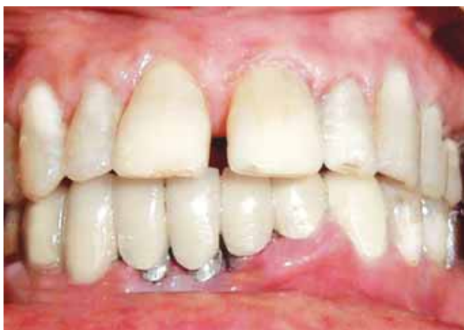
Fig. 6: Metal ceramic FPD