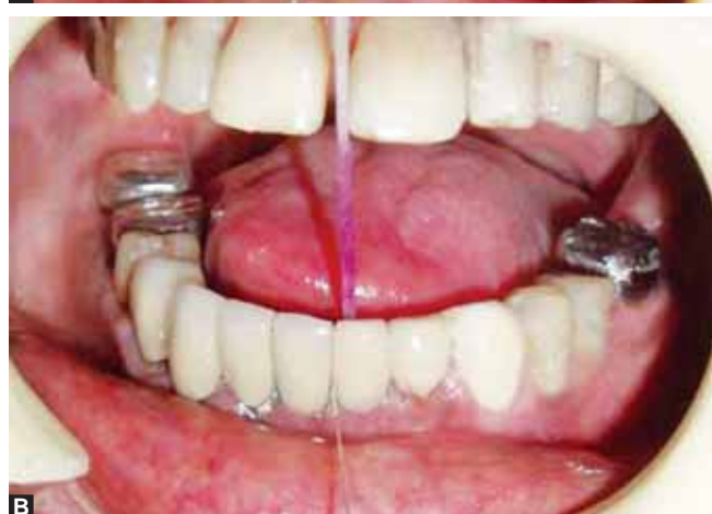
Figs 8A and B: Demonstration of easy cleansibility in the overdenture abutment area

of the previous radiation therapy). The lingual plate major connector in this situation would have had insufficient occlusogingival height to provide rigidity and interfered with tongue movement. 8 Extraction of teeth no. 31, 41 and 42 was ruled out because patients who have received radiotherapy are poor healers prone to osteoradionecrosis (as was evidenced in this case—a 2-year-old nonhealed socket was present at the extraction site of tooth no. 37). Post and core build-up of teeth